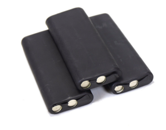
NI-CAD BATTERY PACKS