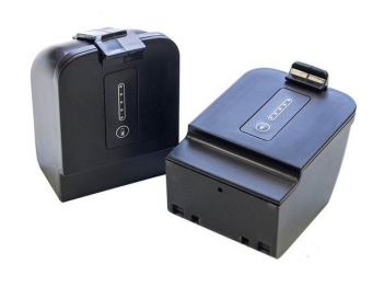
LITHIUM ION BATTERIES