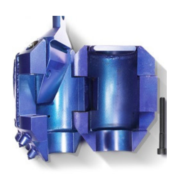
OVER THE BIT REAMERS