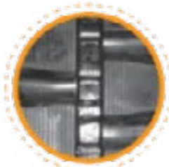
Staggered Block OEM Tread