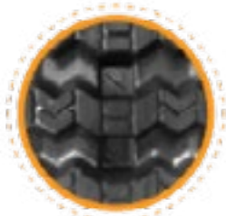
Zig Zag Tread