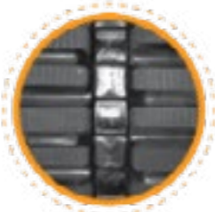
Multi Bar Tread