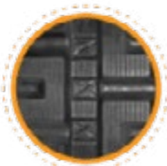
C-Lug OEM Tread